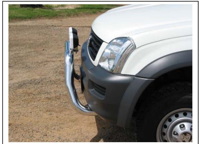
Figure 6 – RA 76mm Nudge Bar side view shown