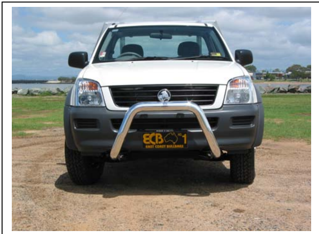
Figure 5 – RA 76mm Nudge Bar front view shown