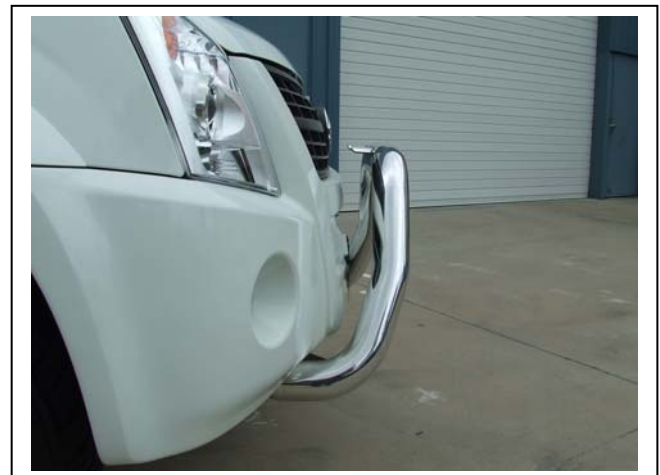
Figure 8 – RA7 76mm Nudge Bar side view shown