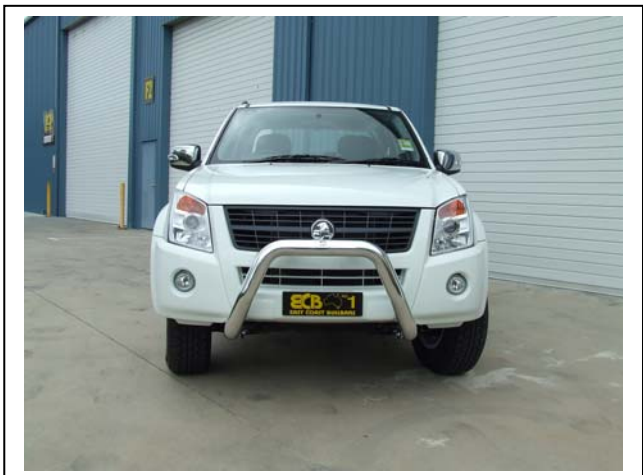
Figure 7 – RA7 76mm Nudge Bar front view shown